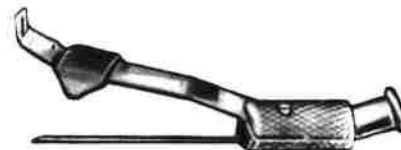
MITCHELL Cannula 38mm SOS 03-078 G18 SOS 03-079 G20