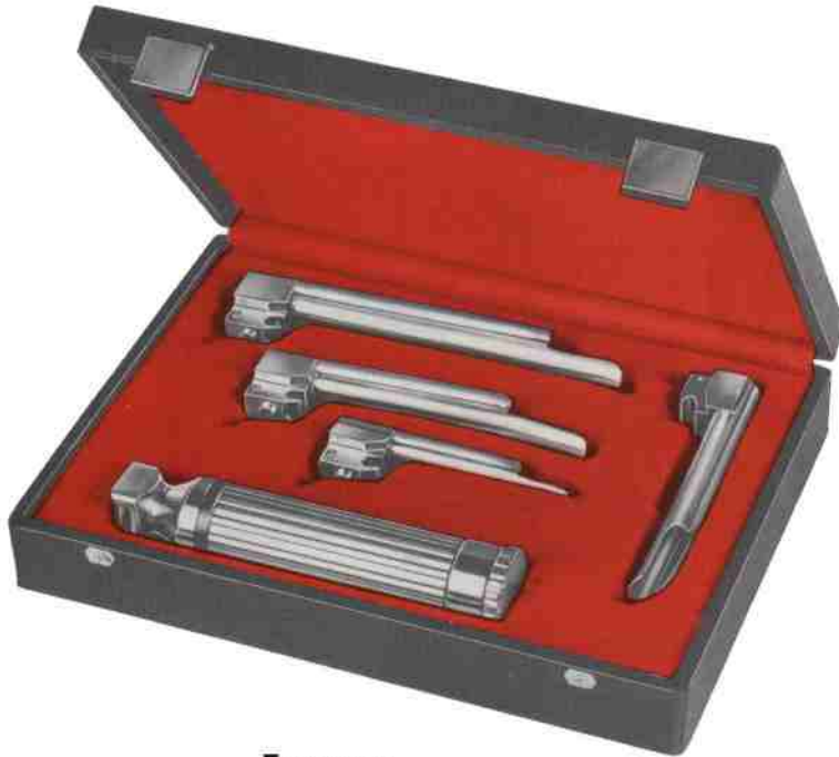
Foregger SOS 03-036