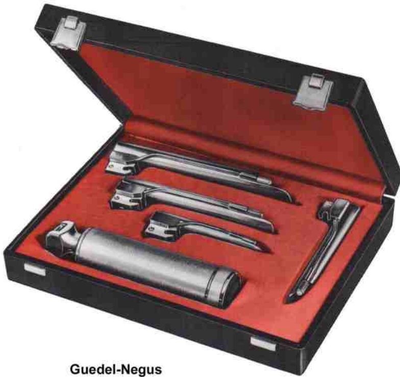
Guedel-Negus SOS 03-011