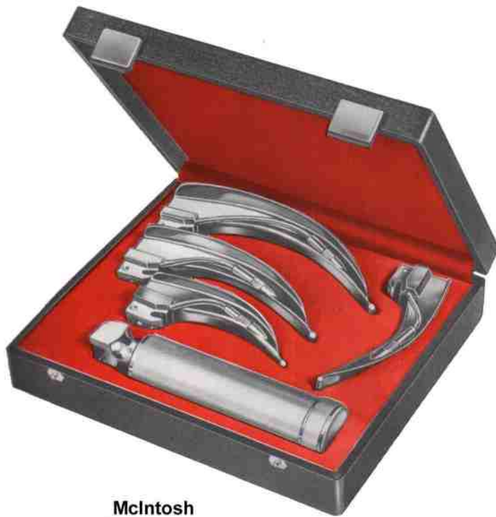
McIntosh SOS 03-022