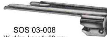
SOS 03-008 Working Length 80mm