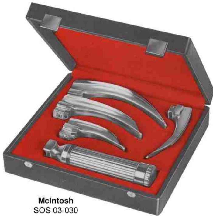
McIntosh SOS 03-030