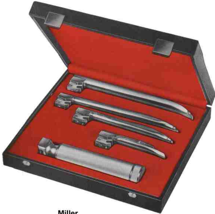
Miller SOS 03-001