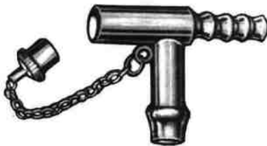
COBB SOS 03-069 Small SOS 03-070 Medium SOS 03-071 Large