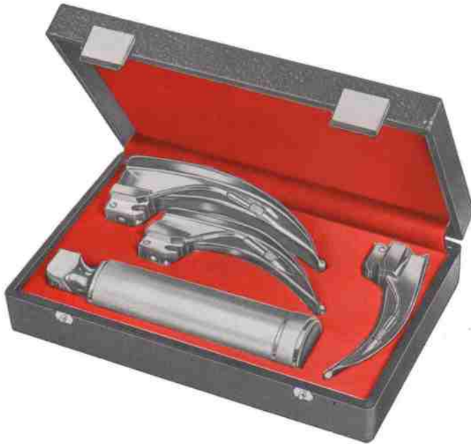
McIntosh SOS 03-016