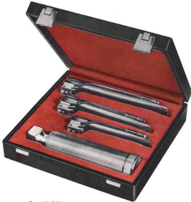
Guedel-Nagus SOS 03-007