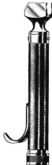
NEGUS SOS 03-051 18mm dia