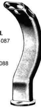
SOS 03-088 child