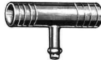
AYRE SOS 03-072 Small SOS 03-073 Medium SOS 03-074 Large