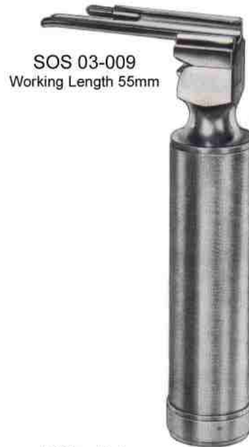
SOS 03-009 Working Length 55mm