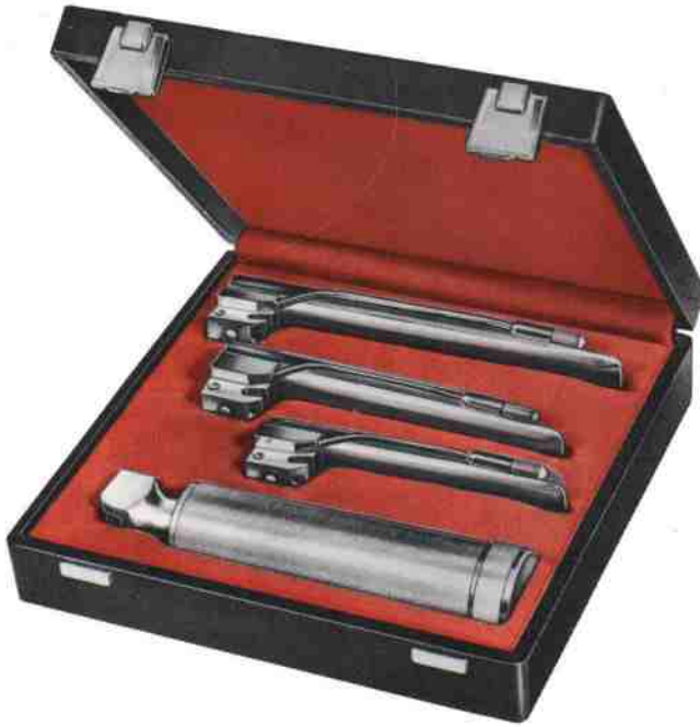
Foregger SOS 03-025