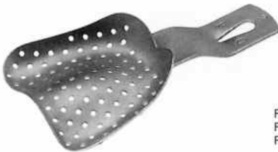
for functional upper impressions