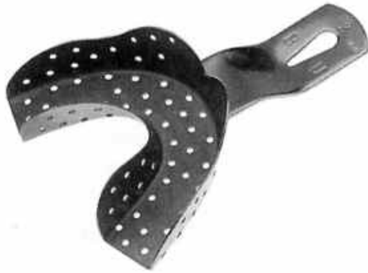
for toothed lower jaw