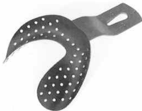
for edentulous lower jaw