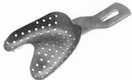
for edentulous upper jaw