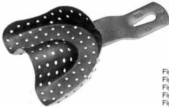
for toothed upper jaw