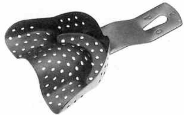
for partially toothed upper jaw