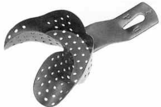
for partially toothed lower jaw